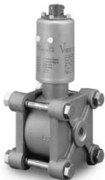
Viatran's 274 Pressure Transmitter

Viatran 3829 Forest Parkway Suite 500 Wheatfield, NY 14120