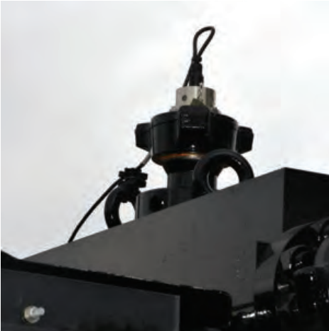
HAMMER UNION MODELS 510, 511 and 520 Pump discharge pressure for fracturing, acidizing, cementing and nitrogen injection