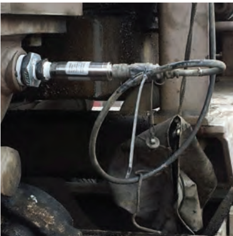
FLUSH TIP MODEL 385 Manifold charge pressure, pump suction