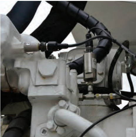
GENERAL PURPOSE MODEL 347 Lube oil and transmission pressure