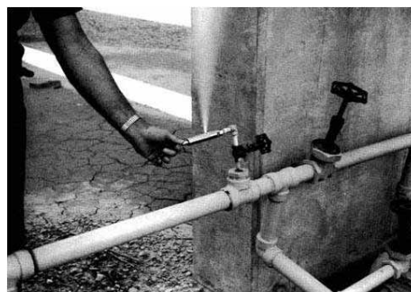
Valve Applied to Transfer Line