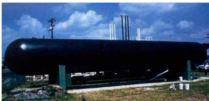
Valve Application on Tank