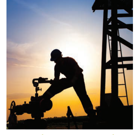
Our rugged pressure sensors and transmitters are renowned for providing robust performance and reliable pressure measurement in the even the toughest environments.

Viatran products are designed to promote oil rig safety at every turn, solving any problems that may occur quickly and easily – with maximum productivity and minimum downtime.