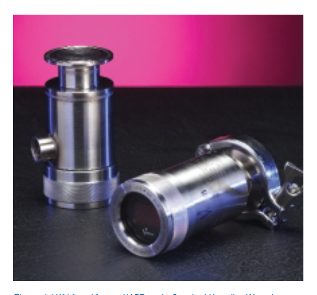
The model X64 from Viatran. HART ready. Standard Hastelloy Wetted parts. Also standard: Viatran's rugged performance and reputation.