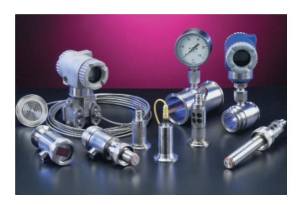
Viatran's Sanitary Pressure and Level Measurement Family