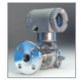
All stainless steel version

The Viatran DP is available with a local display (standard) and optional HART communication (see previous page). All stainless steel housing is also available if needed.