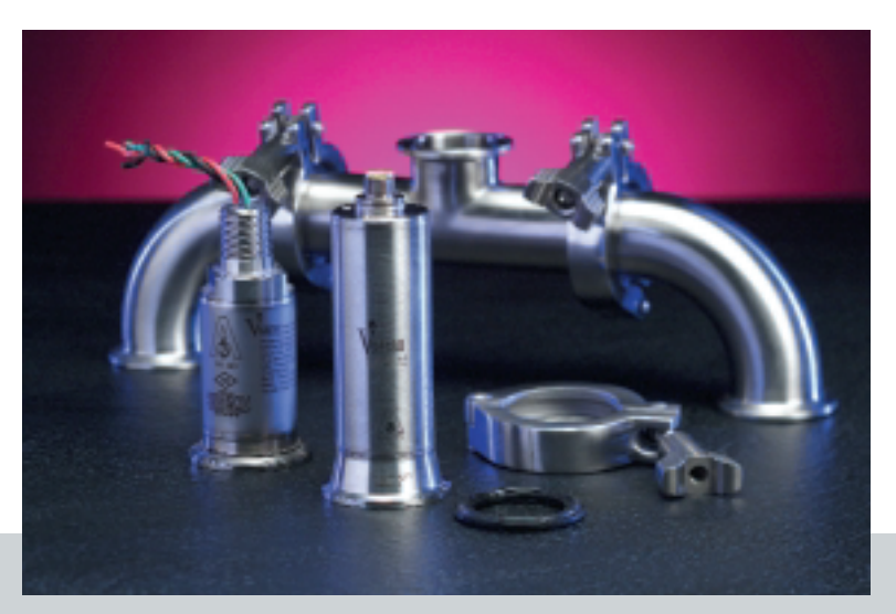
The Model 363 is available with virtually any fitting.

The Model 363 is simple to retrofit. With the unit's high accuracy, quick recovery after a CIP process, internal adjusts, multiple receivers and tri-clamp fittings, the Model 363 is fast becoming the solution for the food processing industry.