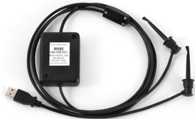
51HMUSB04A shown above with minigrabbers