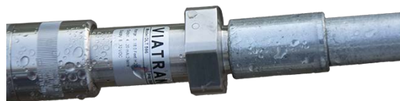
Example of "ZB" Conduit Connection Option on Model 596

Information is accurate to the best of Viatran's knowledge. We reserve the right to change specifications at any time. Please contact Viatran for specific order inquiries.