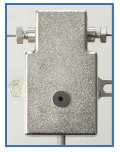
Custom pressure transducer for in-line liquid pressure measurement.

Working closely with a carefully selected custom sensor manufacturer, you can meet almost any reasonable cost, performance and delivery objective. You will also benefit from a partnership that can bring into focus issues that would compromise your design as well as technology advantages that could provide your device or product with a competitive advantage in your marketplace.