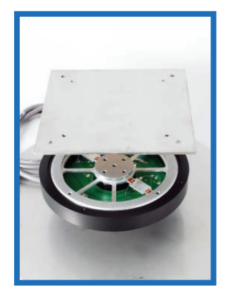
Custom 30 lb. load cell used in the medical equipment industry.

<sup>1</sup>For guidance in deciding whether or not your application requires a custom sensor ask for our white paper Going Custom Sensor.